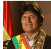
Evo Morales, President of Bolivia