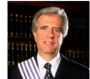
Tabare Vazquez, President of Uruguay

Demonstrating South America's growing support for the World March, Presidents Evo Morales of Bolivia, Rafael Correa of Ecuador and Tabare Vazquez of Uruguay have each endorsed the March in the last two weeks, committing government resources to help make the initiative a success. In his letter to organizers in Uruguay, President Vazquez wrote: "Please count on my endorsement and that of the Government over which I preside because there is no room for doubts or delays with this initiative. Peace is everyone's right and nonviolence is also a shared and permanent responsibility."