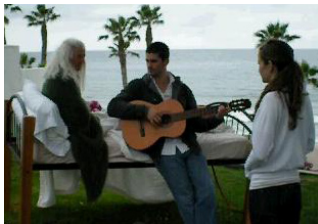
Bed-In at the San Clemente Pier