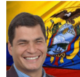
Rafael Correa, President of Ecuador